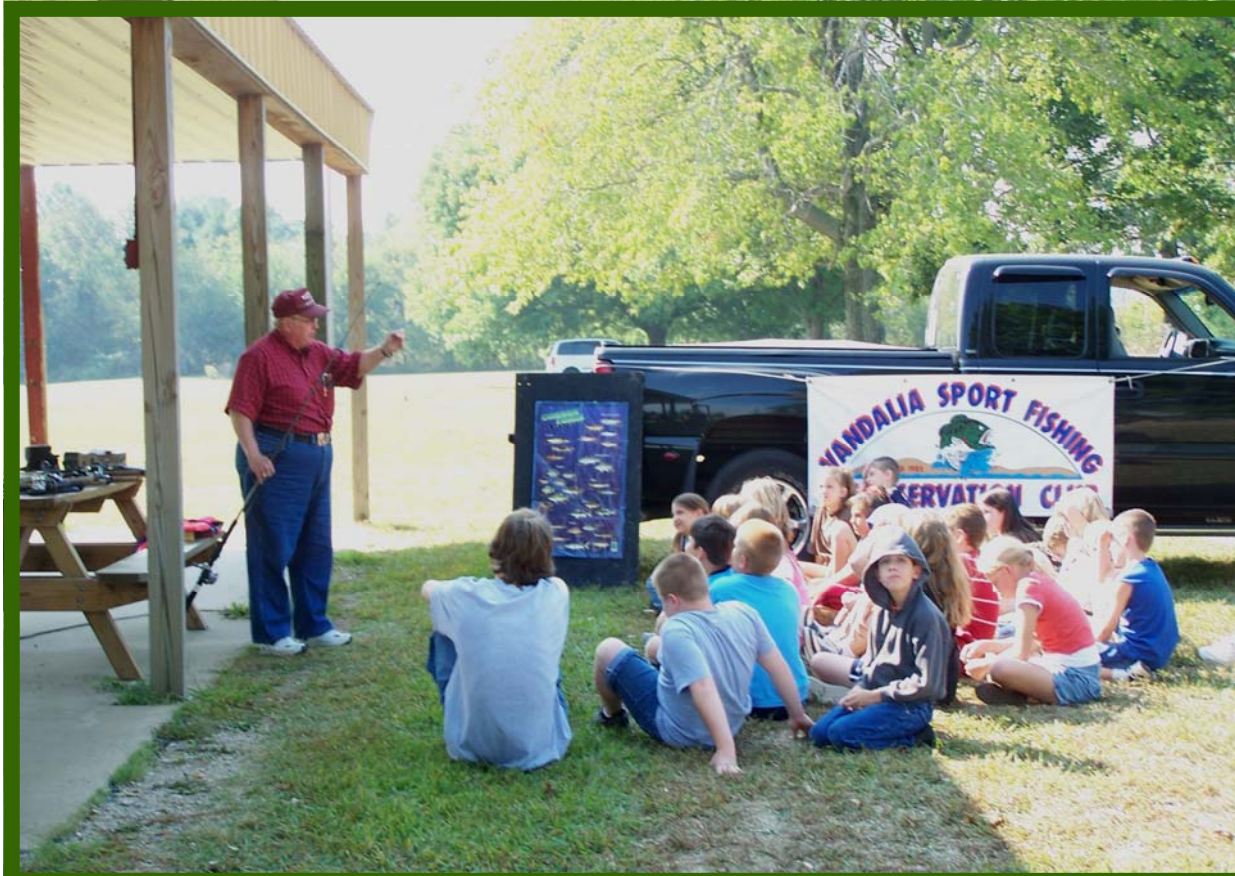
Picture of 2007 Conservation Field Days

63 rd Annual Meeting and Banquet February 21, 2008